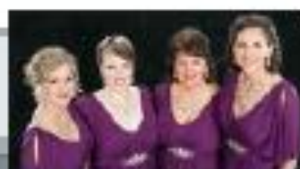
Lustre Quartet 2016 SAI 3rd Place Medalists