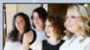
ClassRing Quartet 2016 SAI 8th Place Medalists