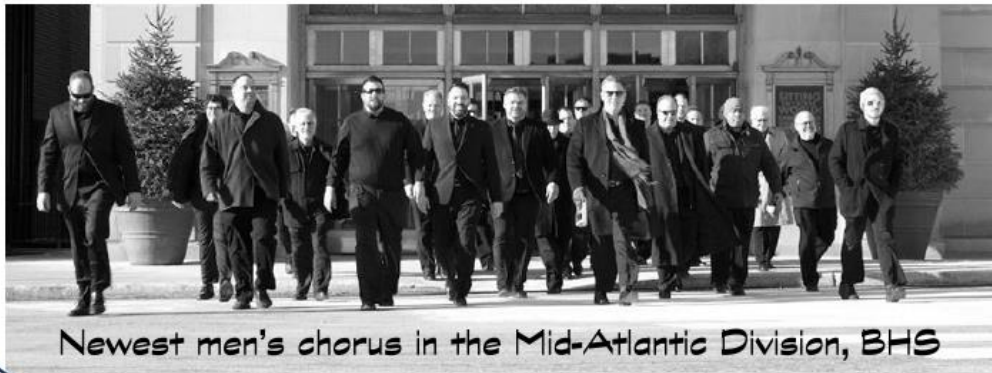
Newest men's chorus in the Mid-Atlantic Division, BHS