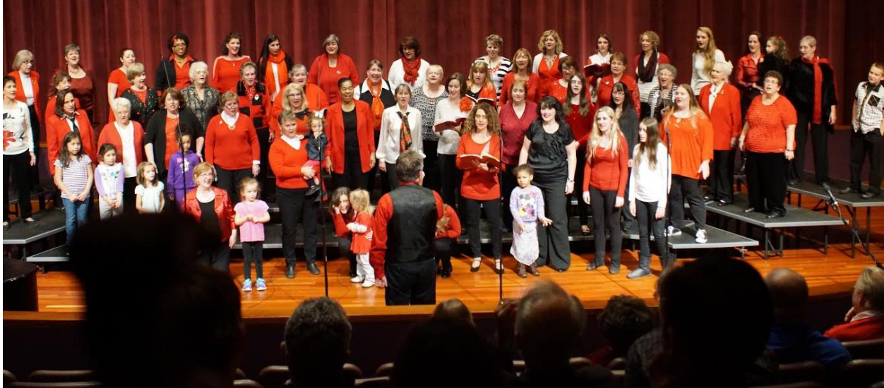
Harbor City Music Company's 2015 Holiday Chorus and children from the audience perform "Let It Go" at the Mormon Temple Visitor Center in Kensington, MD.