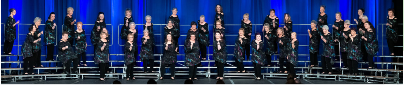
Harmony Classic Division A: Vocal Harmonix Contestant #4