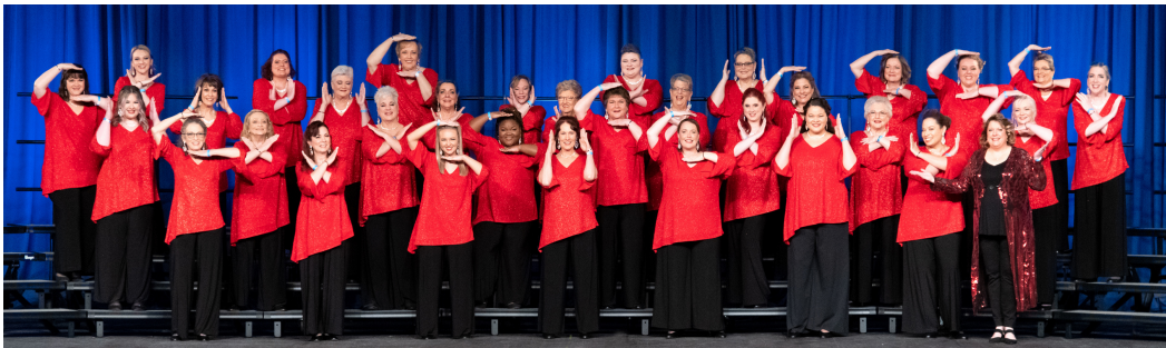
Dundalk Contestant #15