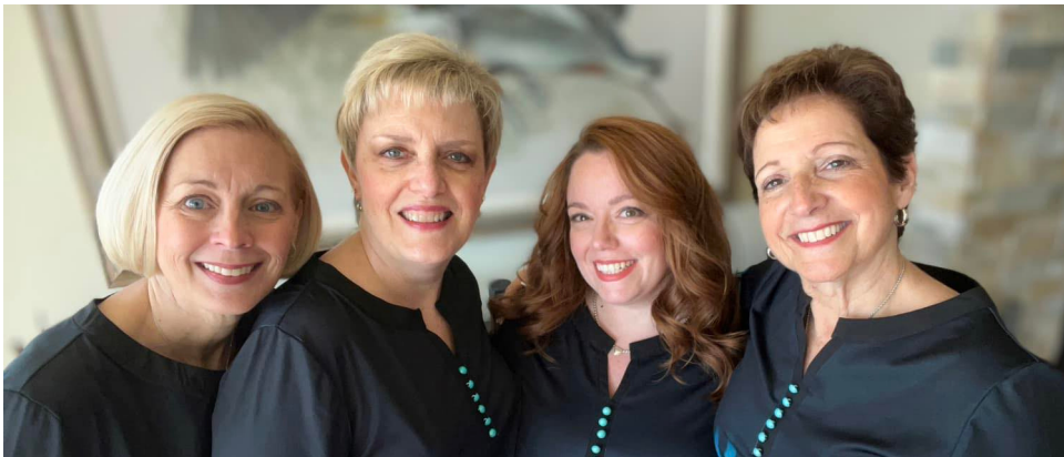
All Fired Up, Contestant #18