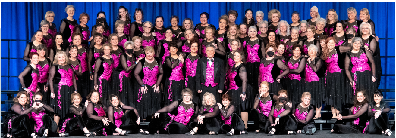
Harbor City Music Company Contestant #31