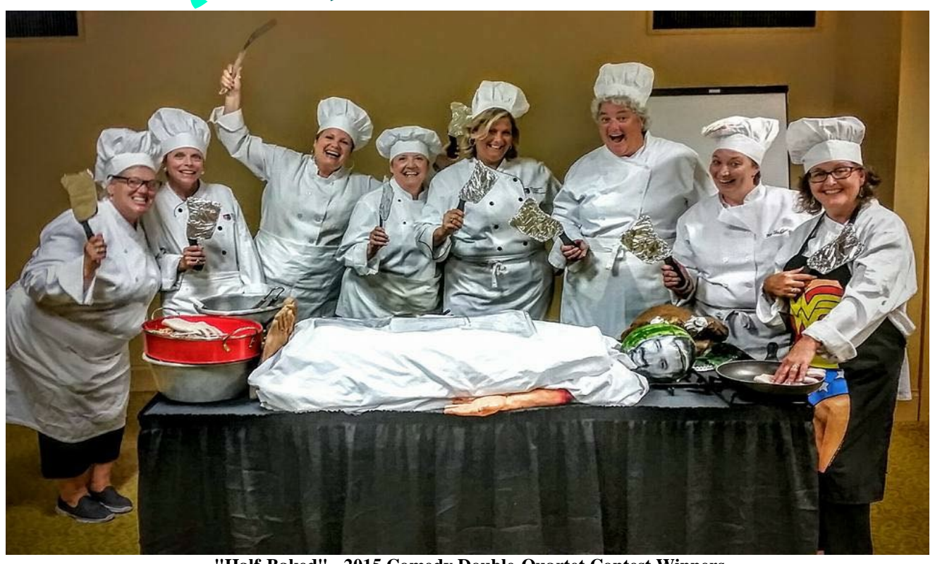
"Half-Baked" - 2015 Comedy Double-Quartet Contest Winners

Grab 7 of your best buds, some great costumes, one parody song and your sense of humor and plan to enter the