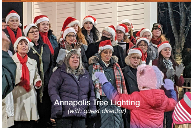
Annapolis Tree Lighting (with guest director)