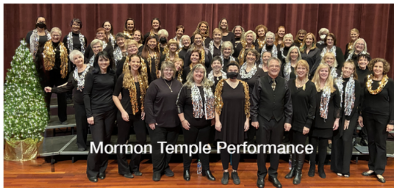
Mormon Temple Performance