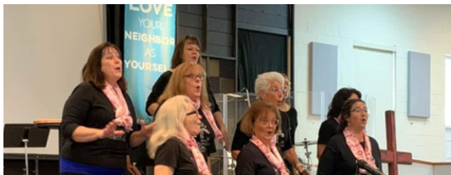
Philadelphia Freedom Chorus