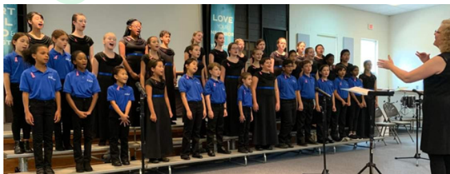
ChildrenSong of New Jersey