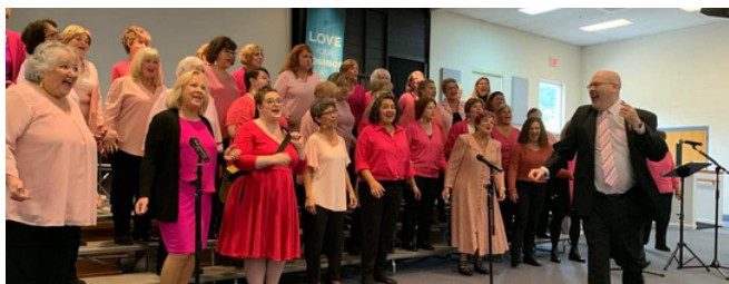
Jersey Sound Chorus