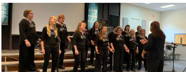
Shades of Harmony Chorus