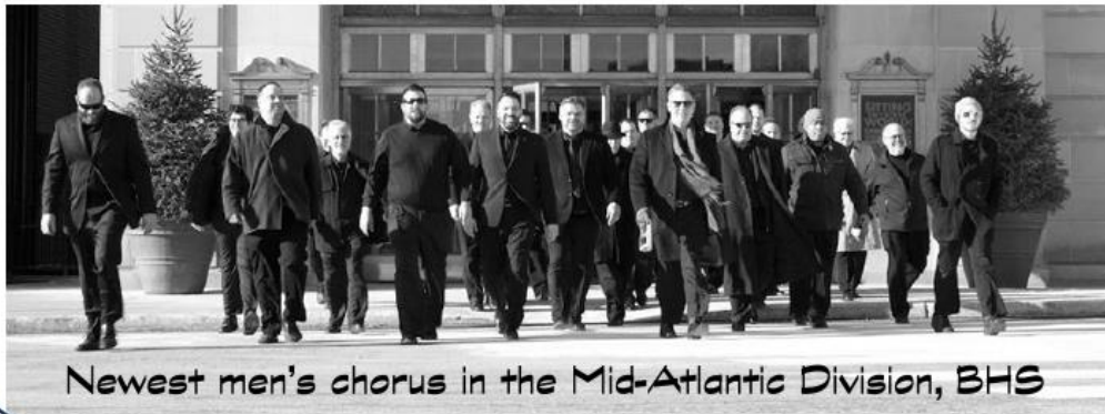
Newest men's chorus in the Mid-Atlantic Division, BHS