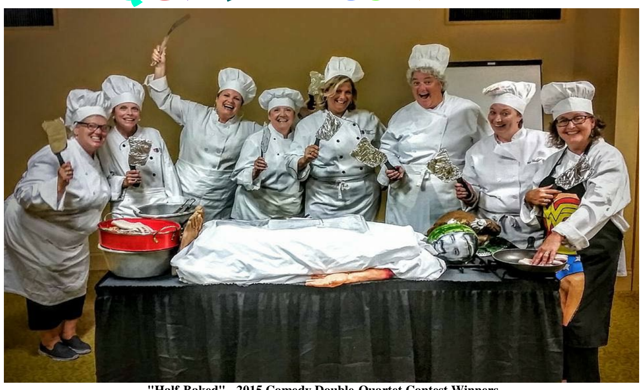
"Half-Baked" - 2015 Comedy Double-Quartet Contest Winners

Grab 7 of your best buds, some great costumes, one parody song and your sense of humor and plan to enter the