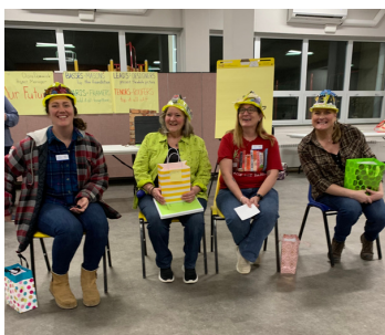
Our four newbies