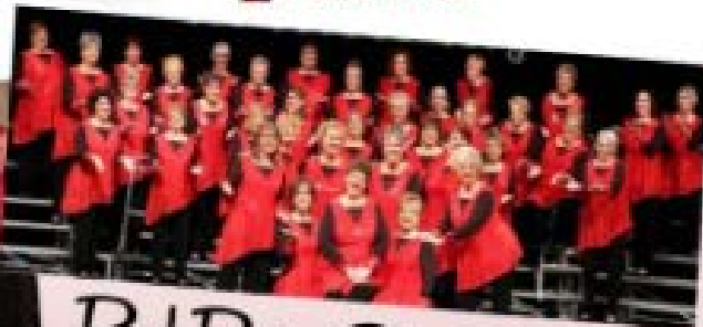
Red Rose City Chorus

Gun shots. A dead man. A detective who takes us back in time earlier that day before the murder happened.