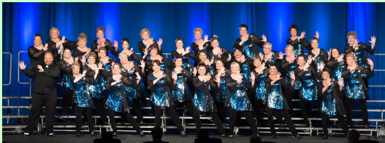
Region 19 Chorus and Division AA Champions: Valley Forge