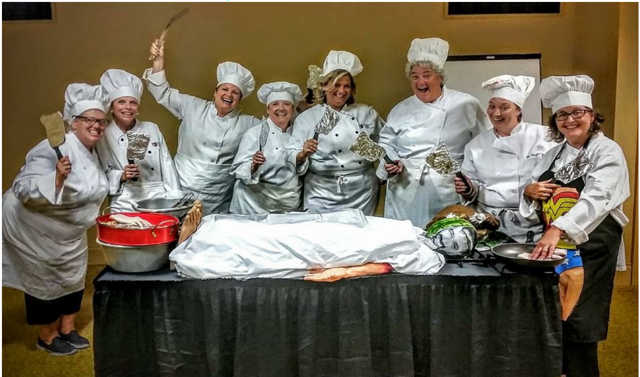
"Half-Baked" - 2015 Comedy Double-Quartet Contest Winners

Grab 7 of your best buds, some great costumes, one parody song and your sense of humor and plan to enter the