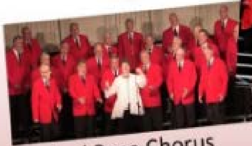
Red Rose Chorus