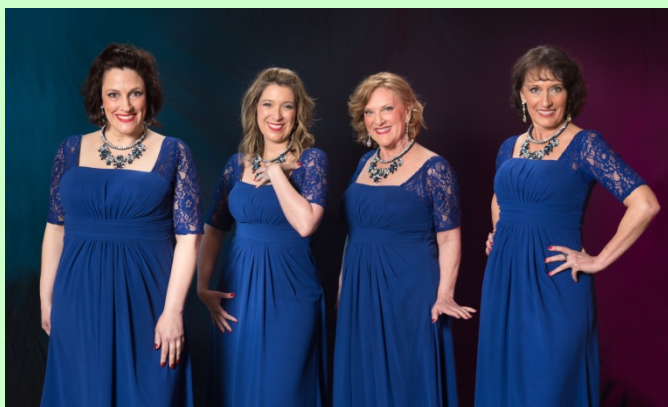
Region 19 Quartet Champions: Famous Janes