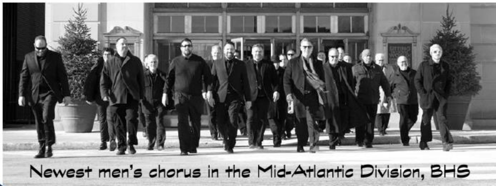
Newest men's chorus in the Mid-Atlantic Division, BHS

Featuring special guest chorus... Parkside Harmony!