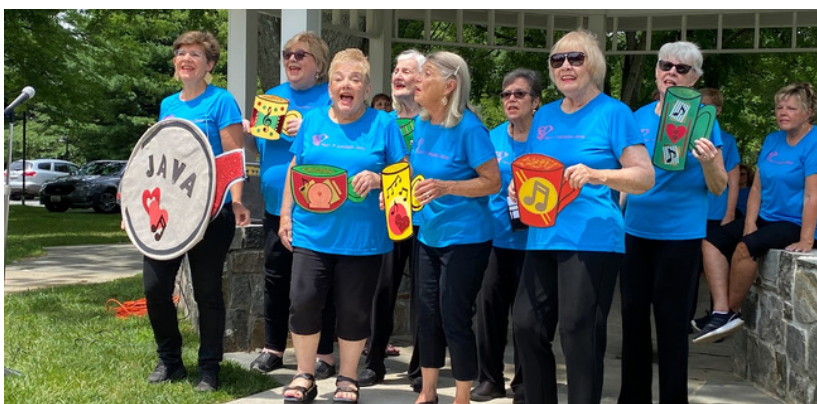
Just in Time