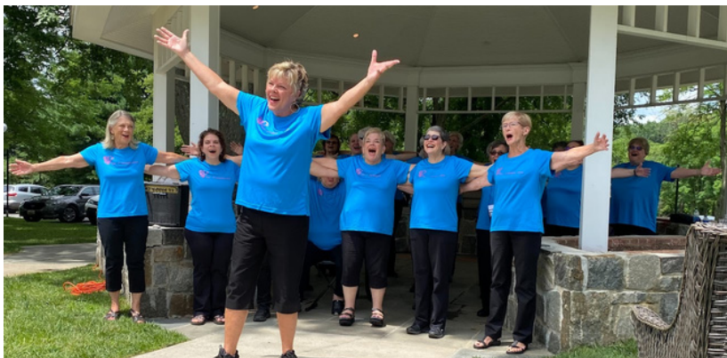
Heart of Maryland Chorus