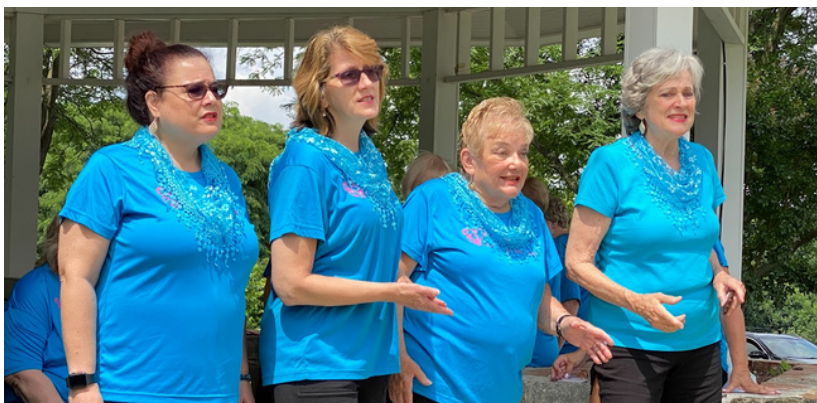
4 Heart Harmony